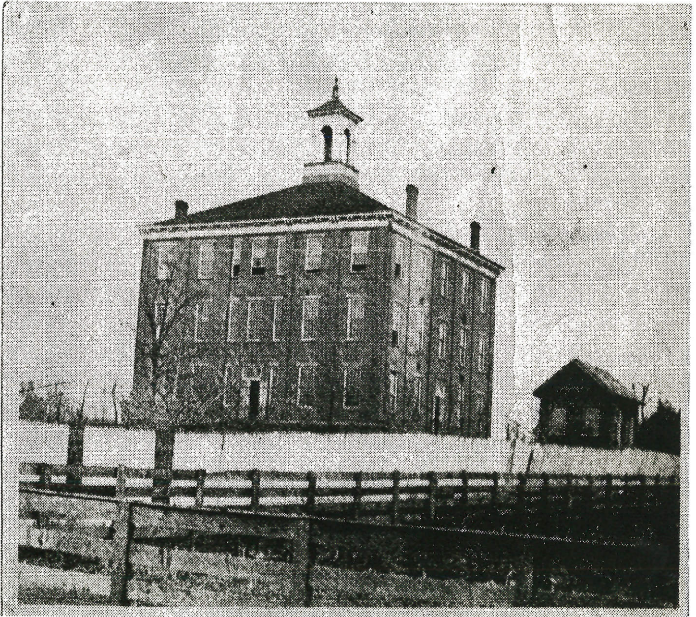
Photo of Union School, built in 1867. Remodeled in 1915 and demolished about 1954.