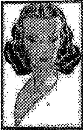
At left: A watercolor illustration of the Dragon Lady drawn by Caniff in 1939.

"Terry" was an immediate smash hit when it debuted on October 22, 1934 as a daily strip ( the Sunday page first appeared in December), and it's success propelled Caniff forever into the eyes of the American public.